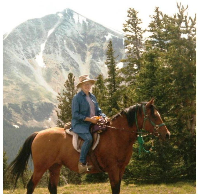
On Bonnie in front of Mt Guyot