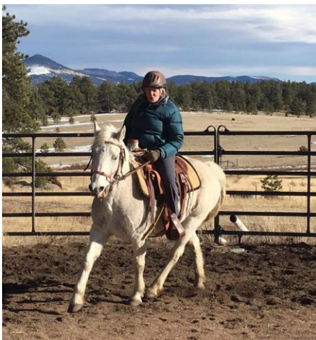
riding Millie, Feb 2017