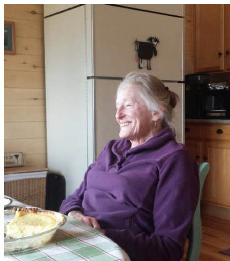
after Irish dinner