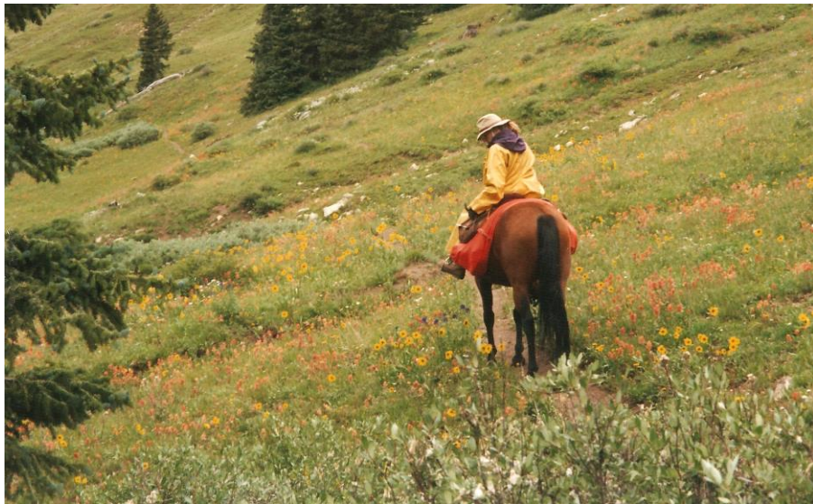
Between Searle Pass & Camp Hale